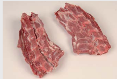
7. The neck is sawn into two lengthways