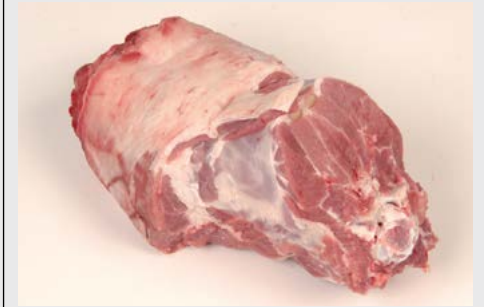
4. Neck of lamb.