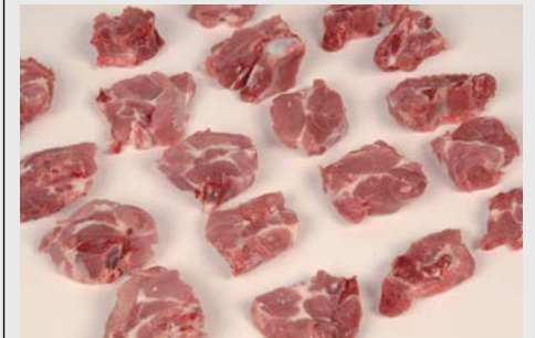
8. and then sawn into 15mm thick slices.