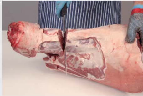
2. The neck is removed