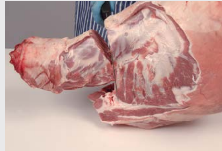
3. in line with the first rib.